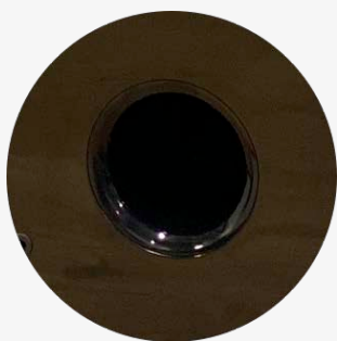
Bass-Reflex port on the front