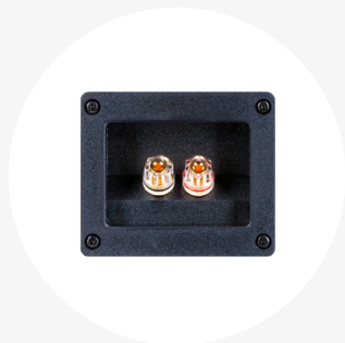
Gold-plated single, screw-on, banana-plug speaker terminals ready