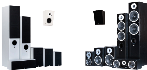
Other loudspeakers of the Raptor series : 7, 5, 3, 1, Mini, Vocal, X

The Raptor 9 loudspeakers considered as a whole are a universal solution for music lovers with a little more space, requiring a seamlessly configured Hi-Fi system, not only from the amplifier fitted with a wide range of power from 50 to 220 W.