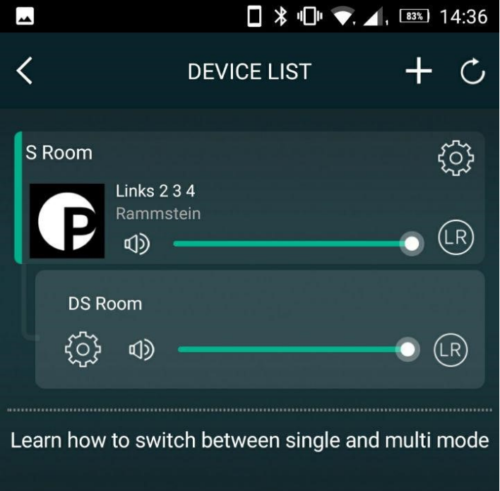
Drag & drop Single Stream Box S2's