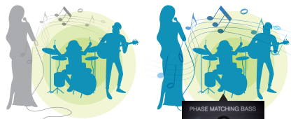
Conventional Bass Boost

Most pre-main amps have a loudness button designed to boost low-mid frequency sound. However, conventional designs are prone to phase-shift, which degrades the clarity of the vocal frequency band. Onkyo's Phase Matching Bass Boost function eliminates phase-shift between low- and mid-range frequency bands above 300 Hz. Bass response is enhanced without compromising vocal clarity, and that's something especially useful when playing music at low volume where bass and high-frequency sounds are more difficult to hear.