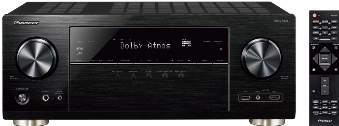
Silver model also available in Europe

Experience the enveloping sound of DTS:X® and Dolby Atmos® featuring the Reflex Optimizer for Atmos-enabled speakers, accompanied by the spectacular view of Ultra HD video, HDR10, HLG (Hybrid Log-Gamma), and Dolby Vision™. FlareConnect™, Chromecast built-in, and DTS Play-Fi® let you stream music anywhere across the house. Listen to a multitude of songs via internet radio and network streaming services, controlled by the Pioneer Remote App. With Powered Zone 2, and a phono and 6 HDMI inputs, a wide range of options are offered on the Pioneer VSX-LX302.