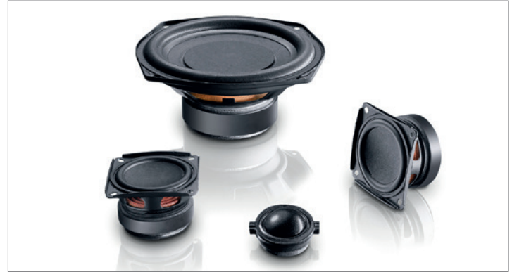
With two tweeters, four mid-range speakers and an integrated subwoofer, it conjures up room-filling sound in the living room.