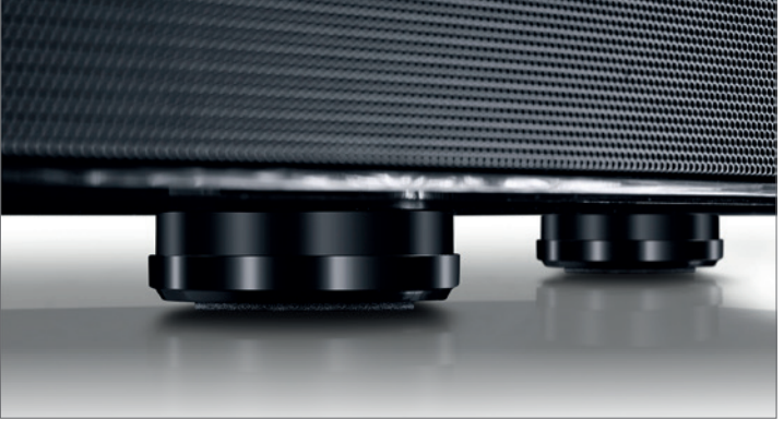
Sturdy feet not only provide a secure footing, but also prevent resonance from occurring.