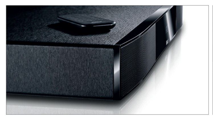
The elegant, velvety black body provides a solid base for TV sets of almost any size.