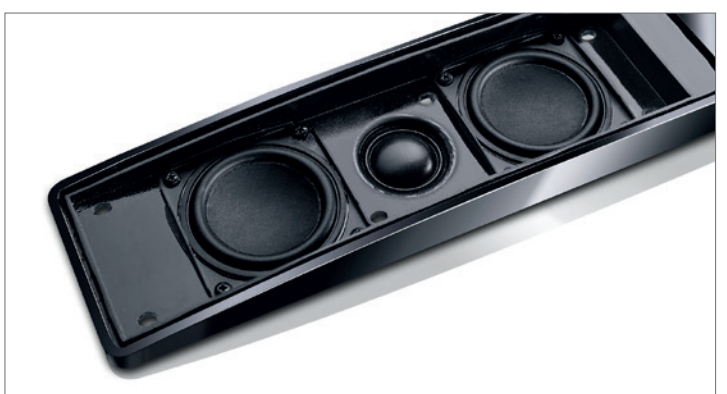
There is, of course, a lot of technology accommodated in the elegant, 70 cm wide housing of the Sounddeck 160.