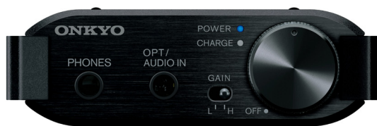
DAC-HA200 Front View