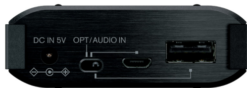
DAC-HA200 Rear View

Due to a policy of continuous product improvement, Onkyo reserves the right to change specifications and appearance without notice. iPad, iPhone, iPod, iPod classic, iPod nano, iPod shuffle, and iPod touch are trademarks of Apple Inc., registered in the U.S. and other countries. "Made for iPod," "Made for iPhone" and "Made for iPad" mean that an electronic accessory has been designed to connect specifically to iPod, iPhone, or iPad, respectively, and has been certified by the developer to meet Apple performance standards. Apple is not responsible for the operation of this device or its compliance with safety and regulatory standards. Please note that the use of this accessory with iPod, iPhone, or iPad may affect wireless performance. All other trademarks and registered trademarks are the property of their respective holders.