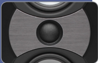
AT's renowned 1" LRT™ soft dome tweeter