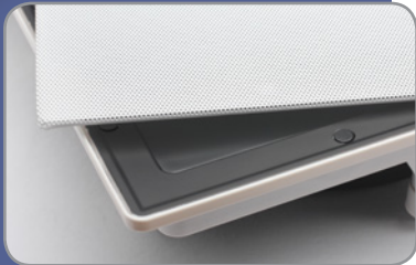
Thin bezel design with magnetic grille attachment